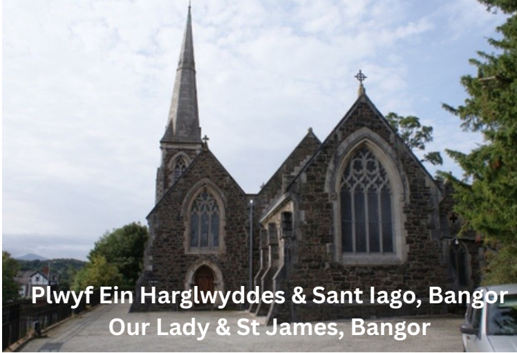
Plwyf Ein Harglwyddes & Sant Iago, Bangor Our Lady & St James, Bangor