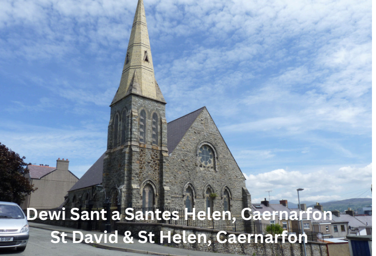
Dewi Sant a Santes Helen, Caernarfon St David & St Helen, Caernarfon

In the month of June, the Church invites us to celebrate the beautiful and profound feast of Corpus Christi —the Solemnity of the Body and Blood of Christ. Each time we gather for the Eucharist, we do far more than remember Jesus; we are drawn into His life and share in His very being. The bread we receive is no ordinary bread—it is truly the Body of Christ. In receiving Him, we are transformed: we become what we receive.